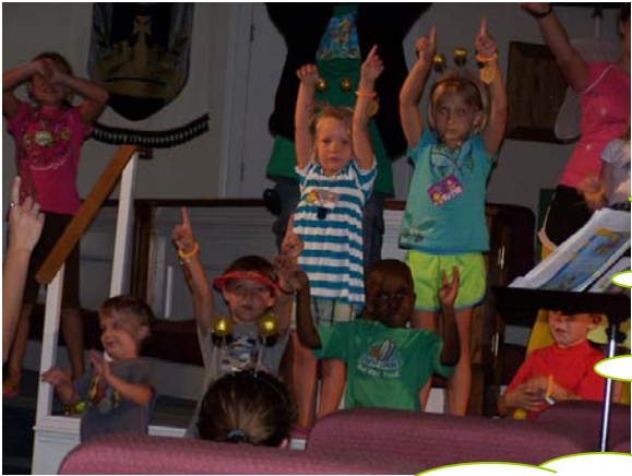
Performing for the Parents!