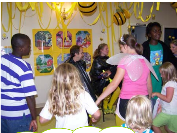
The Rock Mission collection was a success, followed by-----