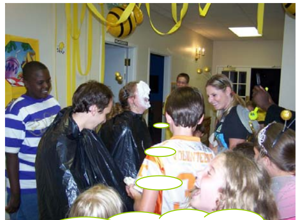
PIE IN THE EYE Mission Accomplished!